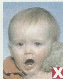
mouth open and toy too close to face