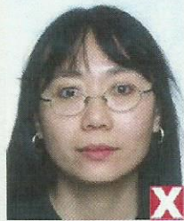
frames covering eyes