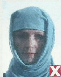
shadows across face