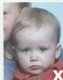
shows another person