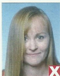
hair across eyes