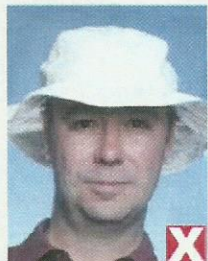
wearing a hat