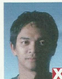
shadows across face