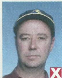
wearing a cap