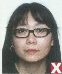
frames too heavy

The portrait shall show the eyes clearly with no light reflection off the glasses and no tinted lenses. If possible, avoid heavy frames. The frames must not cover any part of the eyes.