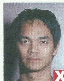
shadows behind head