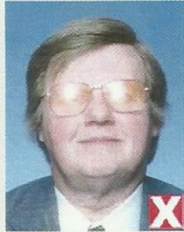
flash reflection on lenses