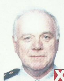
flash reflection on skin